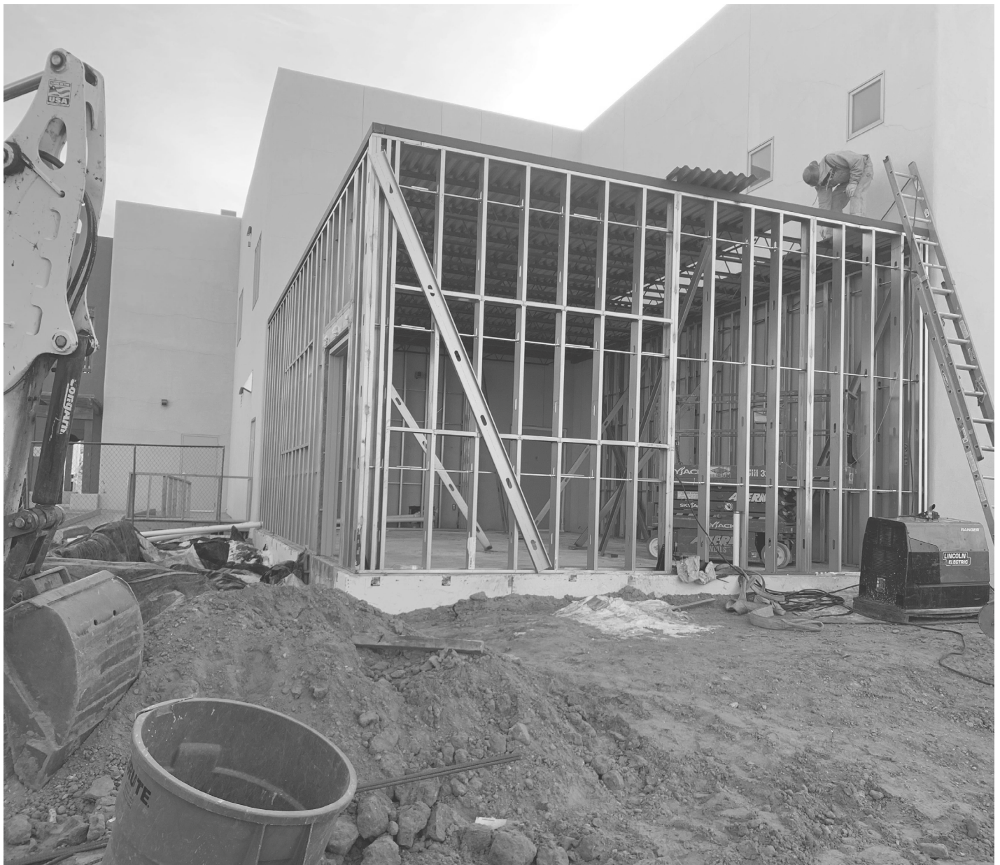
Construction area on the Northside of the Jemez Clinic.

With the Interior Work of the clinic ongoing, this will continue until the completion of the project. The demolition of the existing area inside is now complete. The clinic's south area is continuing with new construction and is estimated to be complete in January 2021. With this completion, the construction will move to the next area.