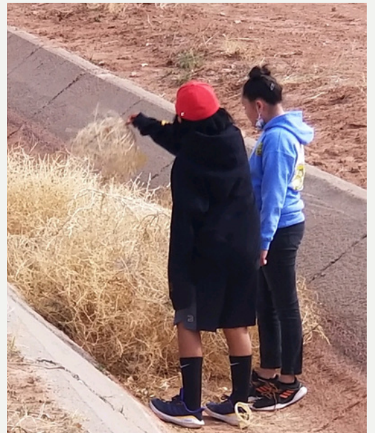
Learning about the traditional water system and water cycle in preparation for seasonal farming.