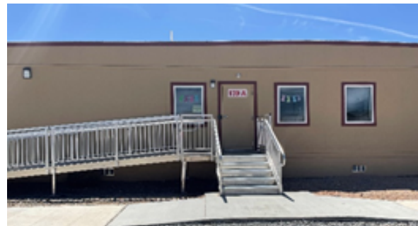
The Walatowa Child Care is temporarily located at 139-A Modular Building (Youth Center Area) on Bear Head Canyon Road. Our hours of operation are: Monday - Friday, 7:45 am - 3:00pm

The children explore and strengthen their motor skills and sensory daily by coloring, painting, exploring playdough, scribbling, pasting and crumbling paper. These activities are only a few activities that the children enjoy and participate in.