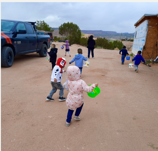
Corn Maiden class Easter egg hunt