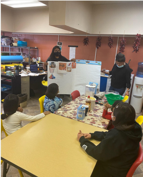
Learning the ingredients of bread in Jemez. Math, science, and hands on learning in action!