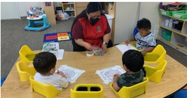
Child Care children creating colorful pictures with the help of a Child Care provider. Children are learning pre-k skills in our Jemez language.

The Walatowa Child Care children have been learning and celebrating "Spring." The children participate daily in small group activities to enhance their early and traditional learning.