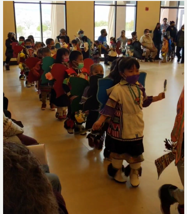
Butterfly dance performed at the reopening of the Jemez Senior Center . Look at the smiles!

As spring approached, children and teachers were excited to be on site again in their classrooms. The children, with the help of their teachers, learned valuable knowledge in our Jemez language. With the opening of our community, the WHSLIP students celebrated special events & occasions with the community and have had the opportunity to dance the Jemez Butterfly dance. It was a blessing to see our young children learning our traditions and language. Families please continue to speak & teach the language to help our children learn and grow culturally & linguistically.