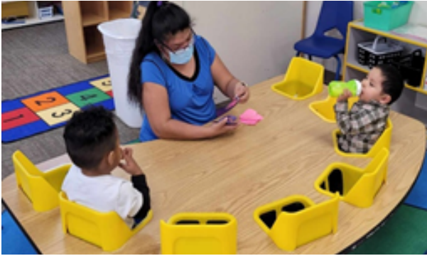
Walatowa Child Care coloring session