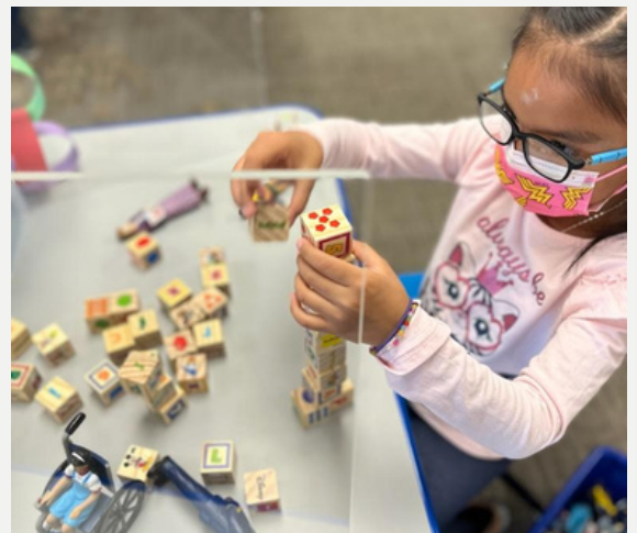
WHSLIP student learning with block building. Look at the creativity!