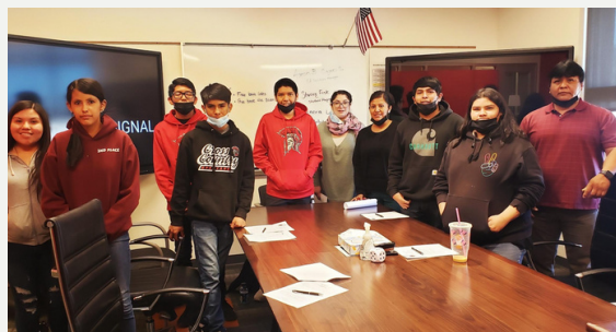
Bernalillo High School Students with Jemez Education Department staff