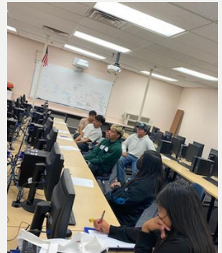
Rio Rancho High students learning about post- secondary educational opportunities.