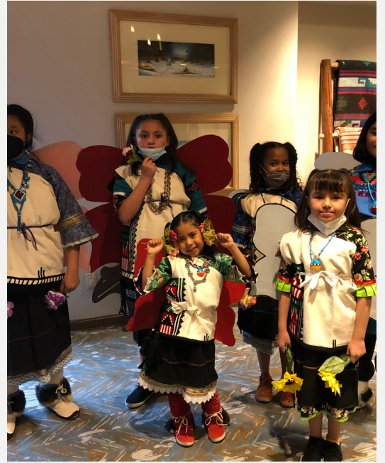
Butterfly Dance at Hyatt Regency Tamaya. How beautiful they are!

We are appreciative of the support received with the implementation of our curriculum by working collaboratively with requests made by our school. A big thank you from our staff, students and parents! Together we are strong!