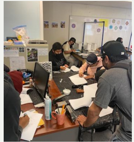
Walatowa High Charter School students filling out student profiles with academic goals and/or careers of interest.

The Jemez Education Services Center in collaboration with campuses on and off the reservation form partnerships to better help our Jemez Students. With the opening of our pueblo, and majority of schools across the state open, we are assisting our Jemez Students by providing educational resources (scholarships, internships, workshops and more to come.) It's important for our students, from Pre-school to Post-Secondary, to reach their individual, academic, and personal career goals. As our school visits continue, we'd like to suggest that parents/guardians please sit down and have your child(ren) share their aspirations and goals with you. Having family support and involvement helps our children to continue to grow, learn and develop.