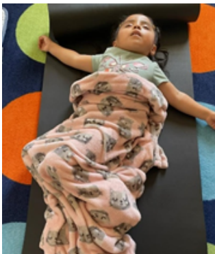
After a busy day of exploration and activities, resting time is needed by all children. Nap time starts at 12:30 pm and ends at 1:30 pm.